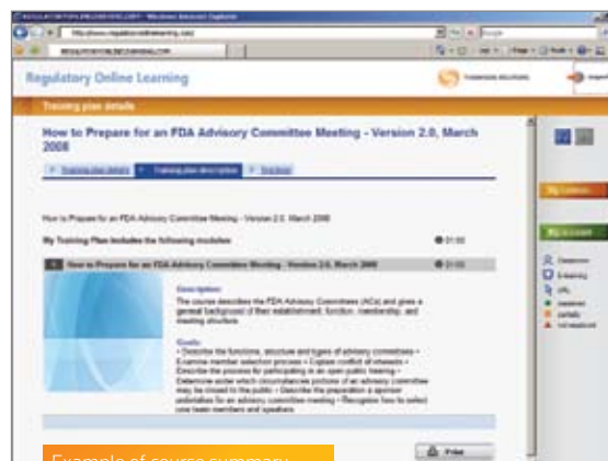
Example of course summary.