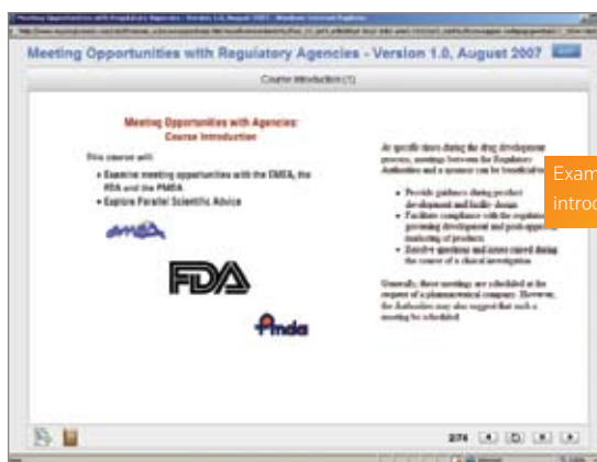
Example of course introduction screen.